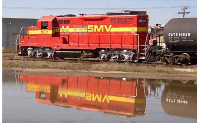
Pictured above is SMVRR's No. 1801, a low-nose GP-9 diesel locomotive. Photo courtesy of Bruce Morden (taken in October of 2004). The other two locomotives are GE 70-tonners with the green-on-yellow paint scheme.

The SMVRR has 6 employees and 3 locomotives.