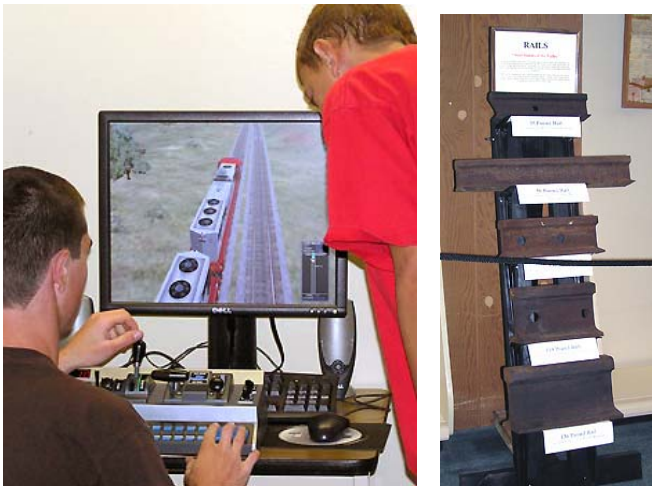
The two fellows pictured above (left) were enjoying the train simulator. The rail display shown above (right) is in the back area of the Museum.