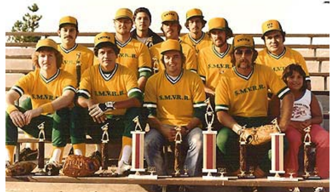
An SMVRR baseball team.

Over the summer we found a batch of photographs of activity on the Santa Maria Valley Railroad (SMVRR) at a local antique store. Here are a few, all circa 1980s: