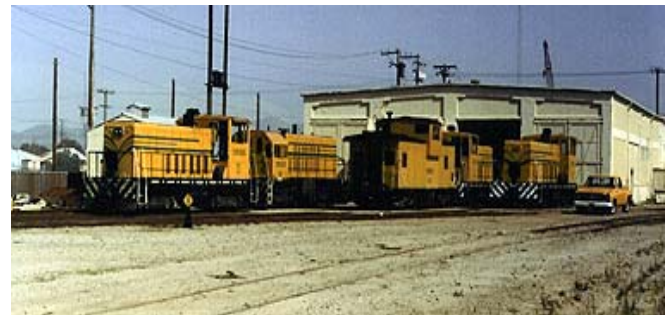
Intense maintenance prior to sugar beet season.