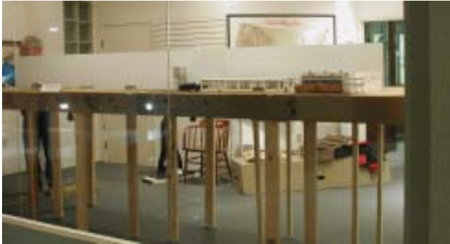
Men at play:

Pictured below is the HO model as it's placed in the Museum's front window. This section is of the downtown yard. It will soon be connected with other sections to make "a loop" and get the trains running.